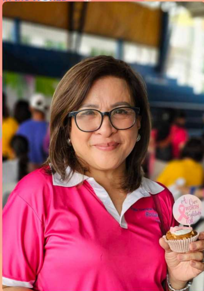
100% PAUL HARRIS FELLOW CLUB