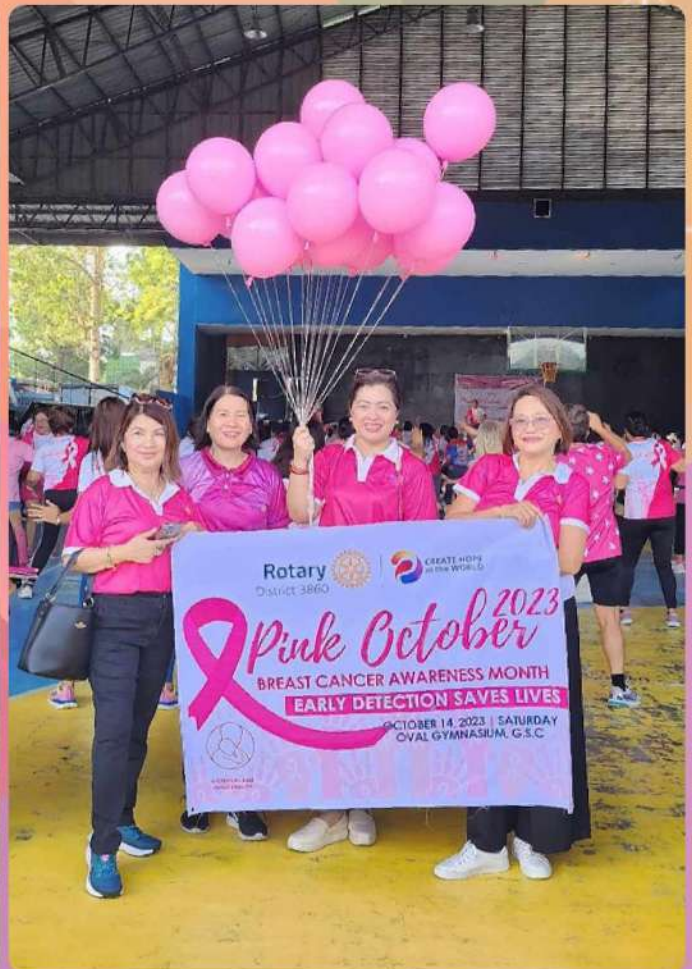
SERVICE ABOVE SELF